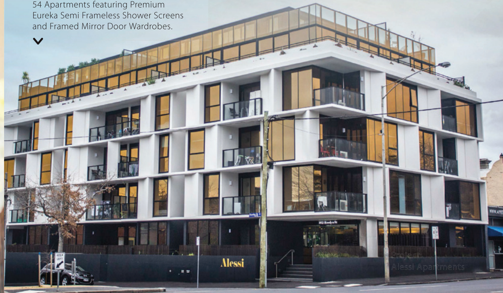
Project: Alessi Apartments